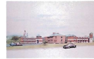
Rendering by: Capital Studio Architects

This year, we have continued working with the College in securing permits to simplify on-campus pedestrian traffic flows and providing base mapping for an upgrade to their athletic track and field.