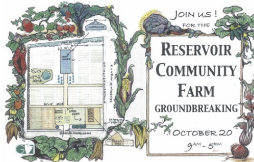
Illustration: Green Village Initiative

Meehan & Goodin recently completed surveys and site engineering for the development of an "urban farm" on a 1.7 acre parcel in Bridgeport. The Reservoir Community Farm will include over 100 raised beds, greenhouse, and an "urban shed". This is a project of the Green Village Initiative and you can learn more about their work at www.gogvi.org