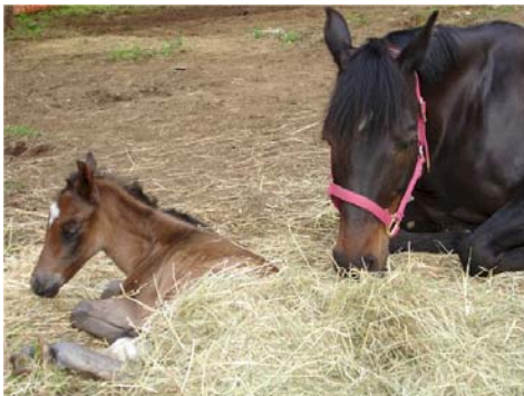
Melody and Serenade resting.

Serenade has taken naturally to tutoring her little shadow, and Melody is already showing many of the attributes which make her mother such an elegant dressage horse.