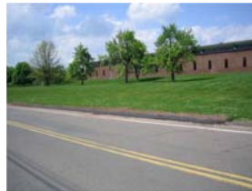
Loading dock modifications.

Many of our clients purchase and occupy buildings and find that after a while their needs or tenants change and the buildings must change with them. The need to retro-fit also brings opportunity: a chance to introduce flexibility and often save dollars.