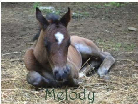
Melody at 8 hours.

387 North Main Street Manchester, CT 06040 Phone: (860) 643-2520 Facsimile: (860) 649-8806 e-mail: info@meehangoodin.com Internet: www.meehangoodin.com