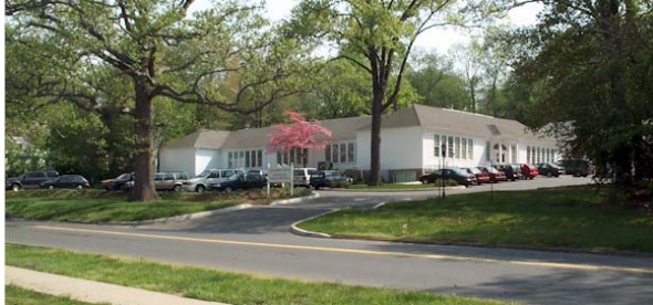
After: No effort was spared to retain existing trees and features.