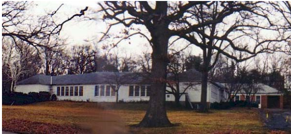
Before: Beach Park School building as it appeared in 1998

Recently featured in the Hartford Courant and hailed as “a perfect fit” for the town of West Hartford, the school has just completed its’ first academic year and has come through with flying colors and glowing reviews. Meehan & Goodin is proud to have been associated with this vital and important project.